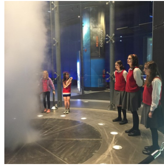
Participating in the Tornado Exhibit