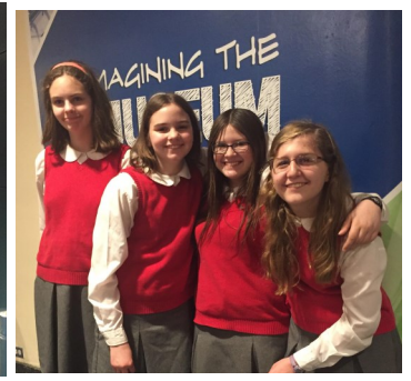
Girls gather to compare notes on what was seen.

4th Quarter Art concentrated on the "Self Portrait." Below are the finished portraits of the 6th grade girls. Can you recognize any of the students in these portraits?!