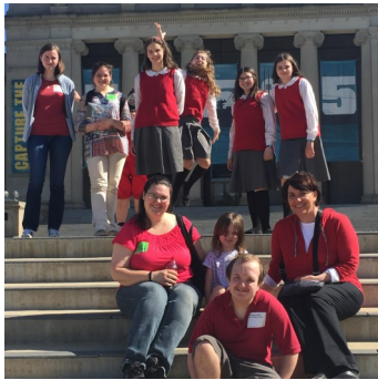
Students gather in front of museum

Below are a few pictures from that remarkable field trip.