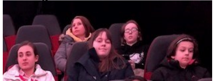
Students of the sixth grade science class examine "The Night Sky" at the Memorial High School Planetarium in Middleton, WI as part of their Outer Space Unit.

In addition to the other core subjects offered in 6th grade, Art is a favorite class among the students. Below are some samples of their art projects. The students are currently learning how to draw the human face, finishing with a self-portrait.