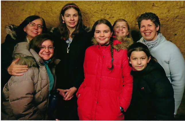
Above: The sixth grade science class visits the Cave of the Mounds during their unit on minerals.